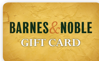
Barnes & Noble