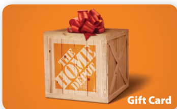
The Home Depot